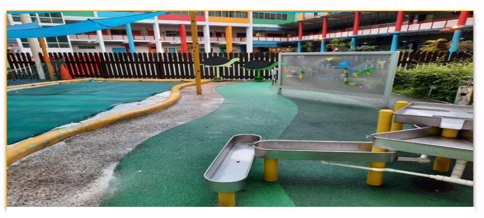
Garden with features that engage children in sensory experiences