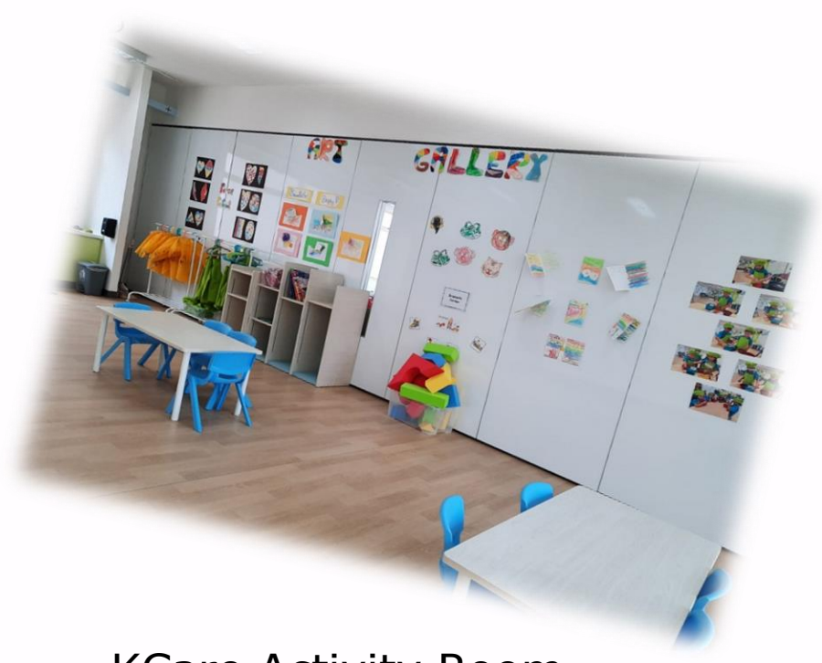
KCare Activity Room