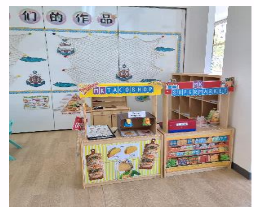
Conducive and stimulating classroom environment to promote holistic development