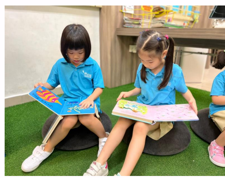
Reading inside the mini-Molly Bus