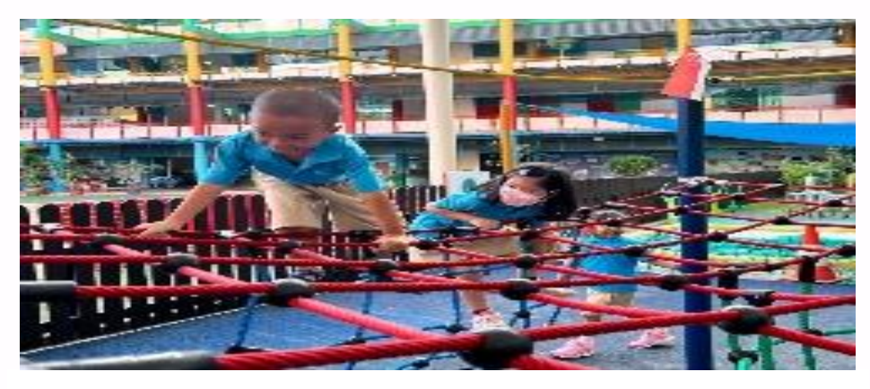
Playground equipment that develops children's movement skills and confidence

Water play features that encourage children to be little investigators